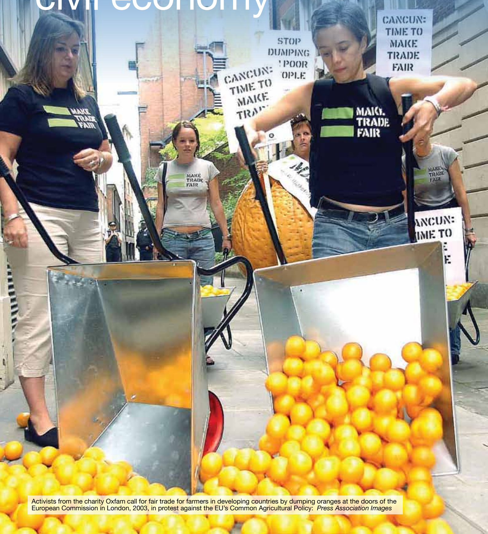
Activists from the charity Oxfam call for fair trade for farmers in developing countries by dumping oranges at the doors of the European Commission in London, 2003, in protest against the EU's Common Agricultural Policy