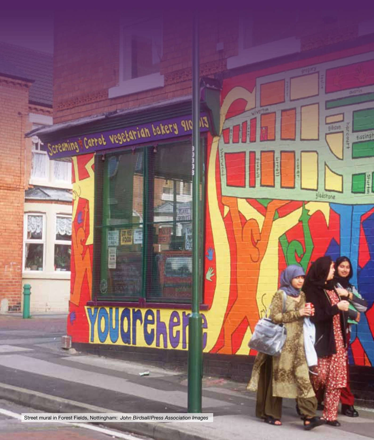
Street mural in Forest Fields, Nottingham