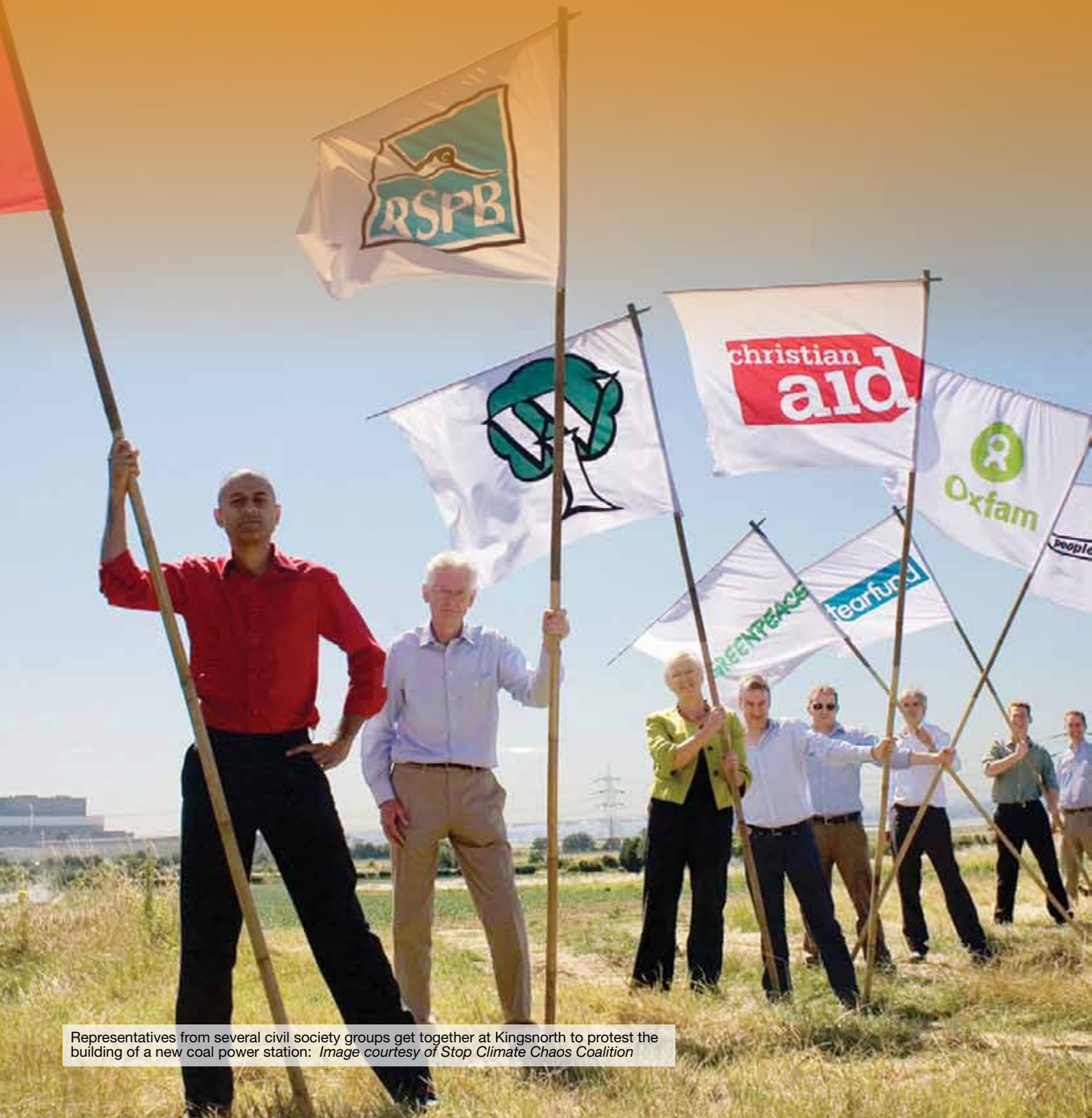
Representatives from several civil society groups get together at Kingsnorth to protest the building of a new coal power station: Image courtesy of Stop Climate Chaos Coalition