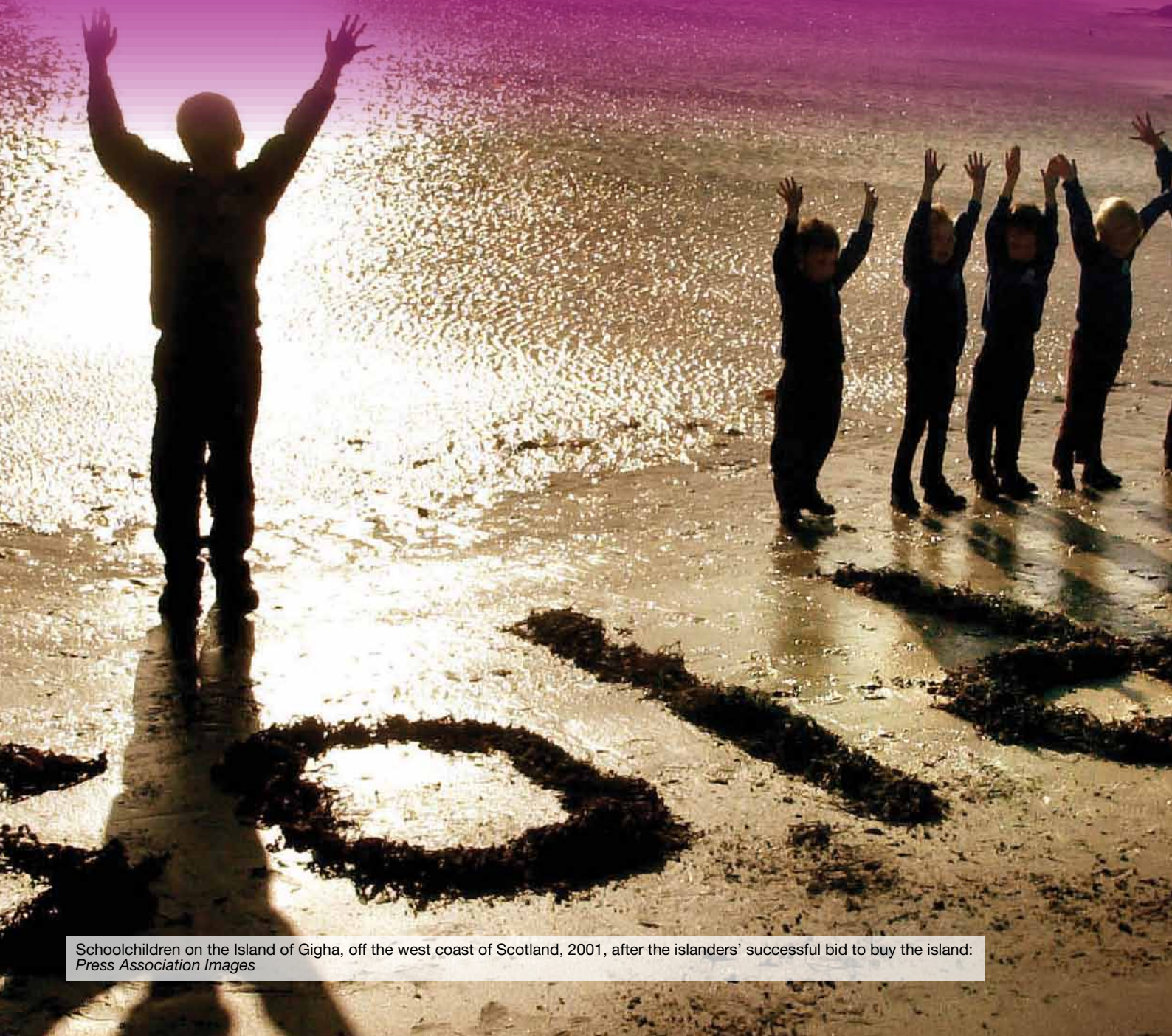
Schoolchildren on the Island of Gigha, off the west coast of Scotland, 2001, after the islanders' successful bid to buy the island