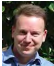
Geoff Mulgan, Commission Chair

This is a great time of possibility for civil society to spread its values not just in fields such as care and community, where it is already strong, but also in fields where it is relatively weak, including the economy and the media, energy and politics. We believe that if that happens, everyone stands to benefit. That is the ultimate promise of the hundreds of projects, ventures and organisations mentioned in this report, which add up to a radical vision of how our society could grow, not just in material wealth but in social wealth too.