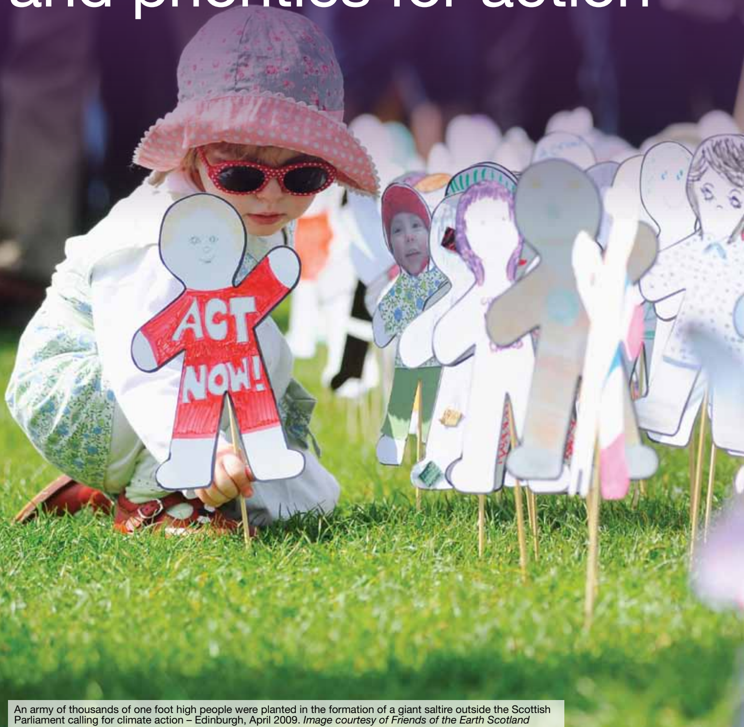
An army of thousands of one foot high people were planted in the formation of a giant saltire outside the Scottish Parliament calling for climate action – Edinburgh, April 2009.