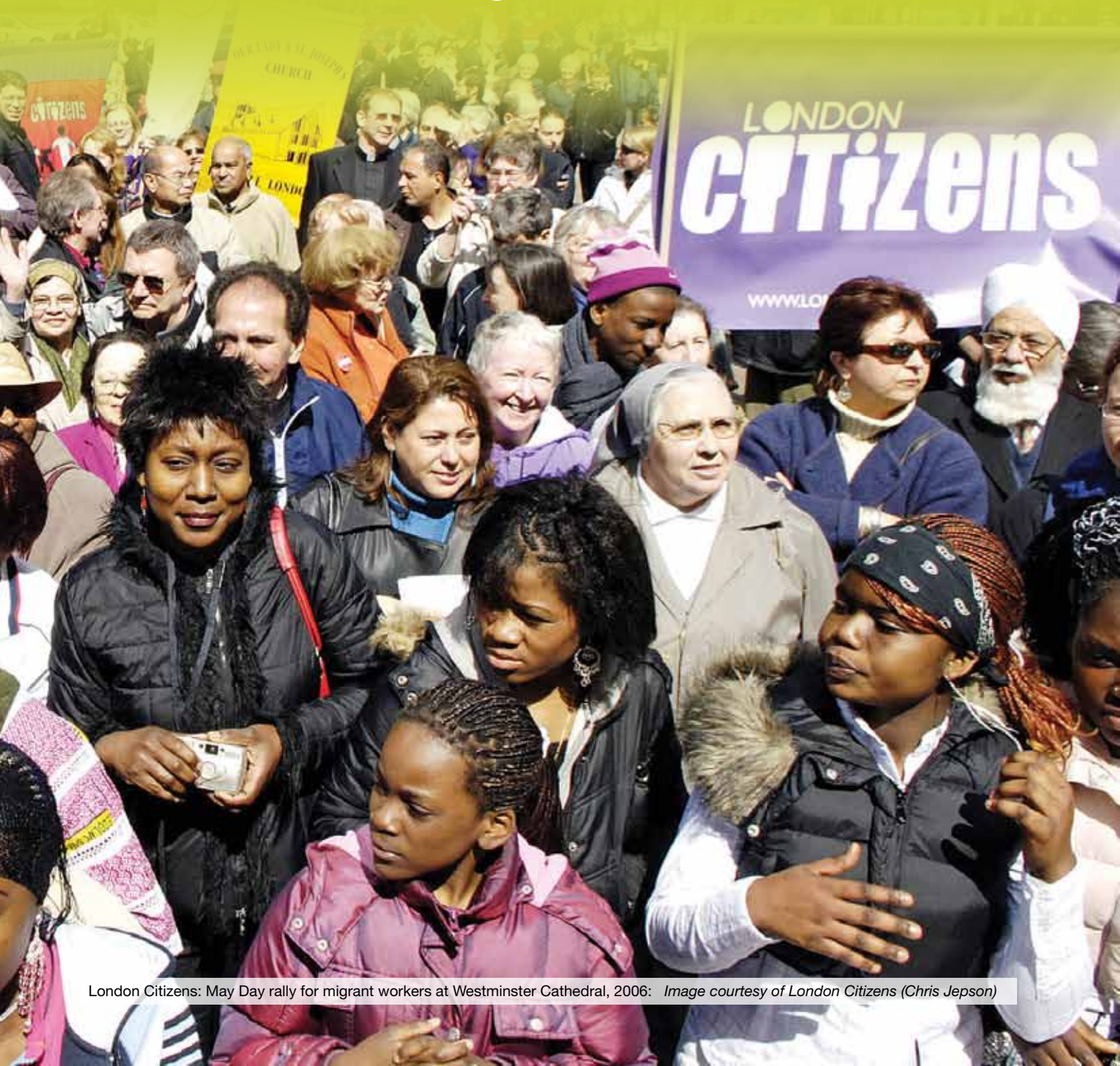
London Citizens: May Day rally for migrant workers at Westminster Cathedral, 2006: Image courtesy of London Citizens (Chris Jepson)